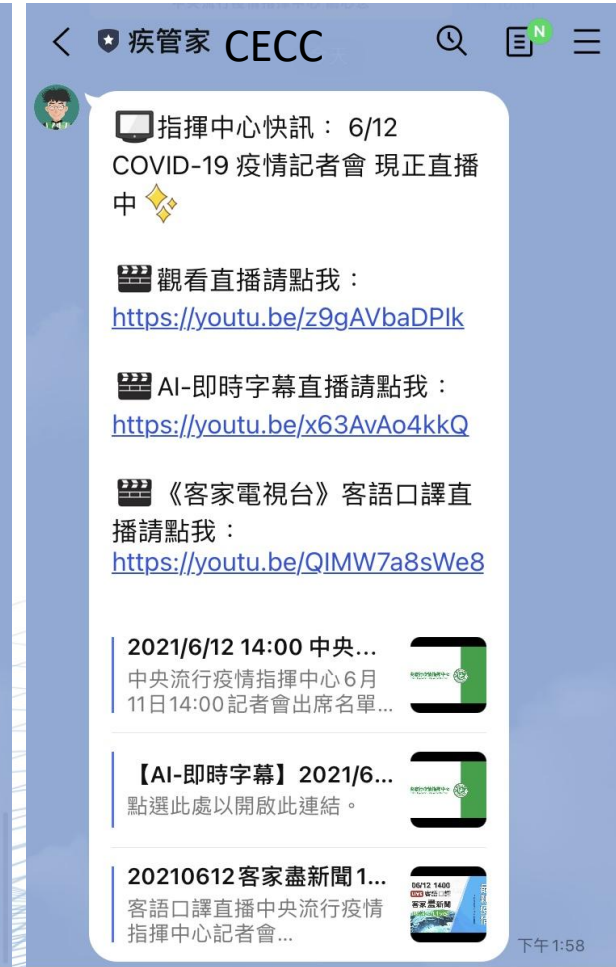
Both MOHW & CECC utilize the Hakka Interpreting