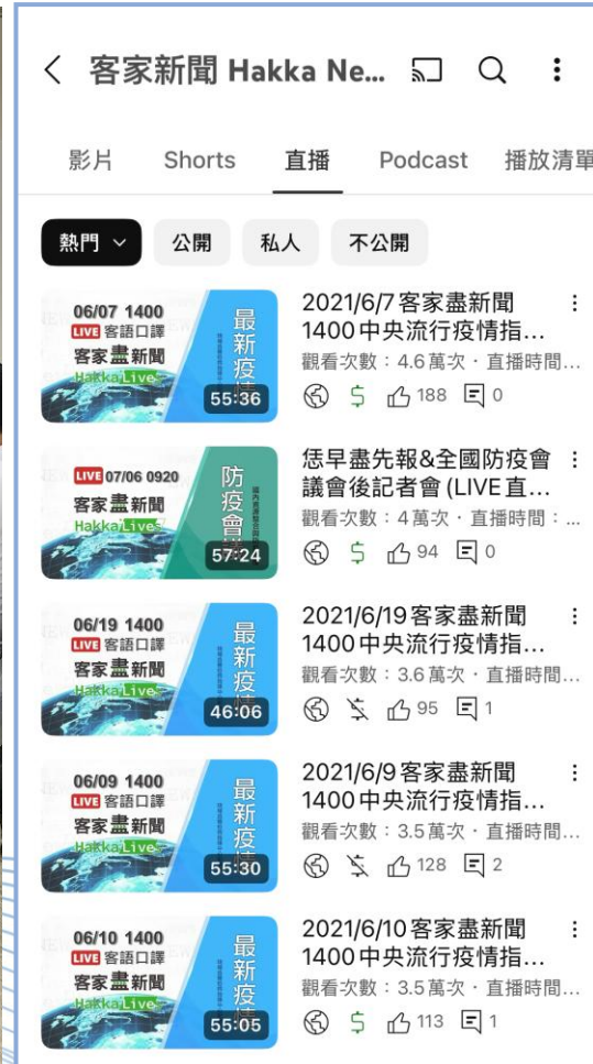
Live on TV & YT