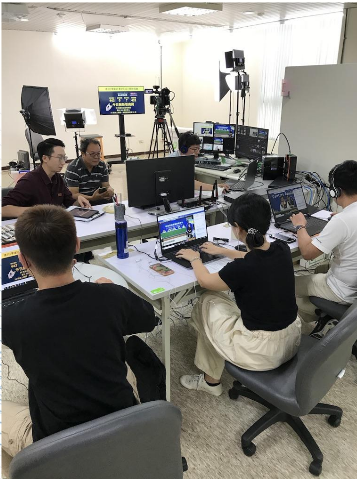
An isolated team